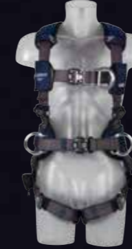
ExoFit NEX™ Construction/Climbing Style Harness Tech-Lite™ front, back and side D-rings, Duo-Lok™ quick connect buckles and sewn-in hip pad and body belt.