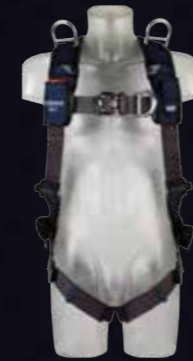
ExoFit NEX™ Rescue Harness Tech-Lite™ front and back D-rings, 2 x shoulder Rescue Attachment Points, Duo-Lok™ quick connect buckles.