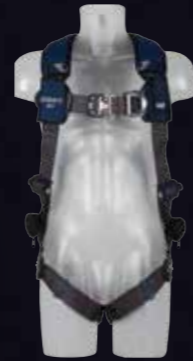
ExoFit NEX™ Climbing Harness Tech-Lite™ front and back D-rings, Duo-Lok™ quick connect buckles.