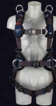
ExoFit NEX™ Rescue Harness with Belt Tech-Lite™ front, back and side D-rings, 2 x shoulder Rescue Attachment Points, Duo-Lok™ quick connect buckles and sewn-in hip pad and body belt.